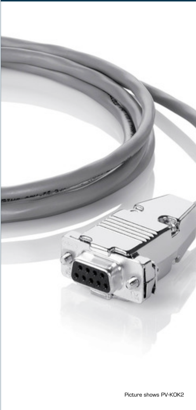
Picture shows PV-KOK2